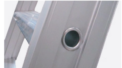
Surefoot features a step to side rail assembly that reinforces the joint with a internal flanged tube

SureFoot has a load rating of 150 kilos, and is designed to meet the requirements of Australian standard AS 1892.1:2018 and the European Standard EN 131: Parts 1 and 2.