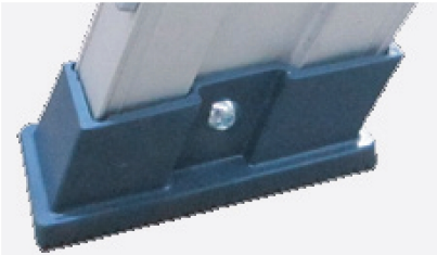
SureFoot features a wide full-boot foot ensuring an excellent on-ground grip for safe working